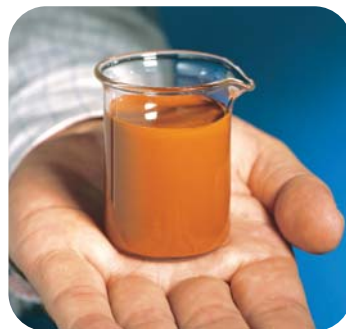
The different ViroMine™ Technology reagents were applied in slurry form.

Treatment at the site was conducted in three successive phases. At the completion of each phase the treatment was scaled up with the third and final phase seeing the discharge of clean, treated water into the local environment as detailed overleaf.