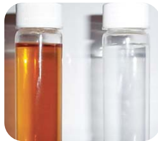
ARD at the Aqua Forte site before and after treatment with ViroMine™ Technology reagents.