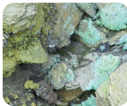
Left: The tailings dam that was treated. Right: Water flowing into the dam contained very high heavy metal loads, leaving deposits like these.