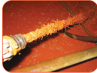
Virotec's mobile ViroFlow™ Technology Mixing and Dosing Plant being used to treat the moats.