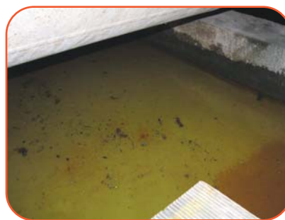
Suspended ViroBond™ reagent particles that bound the heavy metals have settled to the bottom following treatment.

The figure below shows the clarity of the treated solution in one moat, with a layer of non-toxic sediment remaining on the bottom.