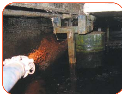
ViroBond™ reagent being applied to another of the internal moats.

The sediment formed when ViroBond™ reagent settles and dries is not a waste and has potential re-use applications. The sediment holds the bound CCA metals sufficiently tightly that they can neither be taken up by plants, nor released back into the water body. This property, combined with the high organic matter content of the solids, makes them potentially useful as a soil conditioner.