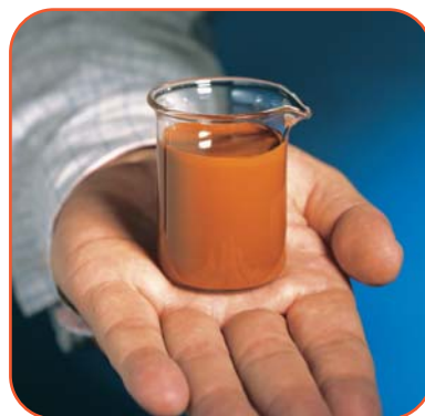
ViroBond™ reagent immobilises heavy metals into an insoluble, non-hazardous sediment.

The ability of ViroBond™ reagent to strip trace metals increases with time and because most metals bound by ViroBond™ reagent are held as structural components of low solubility minerals, they cannot be easily removed.