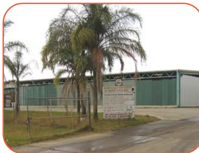
The Hyne timber preservation facility being decommissioned.

Virotec's solution involved adopting ViroFlow™ Technology using proprietary ViroBond™ reagent to effectively and permanently remove the metals from the solution and to bind them in a non-toxic layer on the bottom of the moats. The ViroFlow™ Technology treatment is a custom designed multi-stage treatment applied in three integrated stages, using the mobile ViroFlow™ Technology mixing and dosing plant to apply the ViroBond™ reagent evenly around the moats.