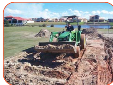
Figure 5 (Right): Top soil being applied prior to turf being relaid.

of ViroBind™ reagent. The surrounding fairway, which still had many areas of scalding, served as a further control area where no disturbance to the turf or soil occurred.