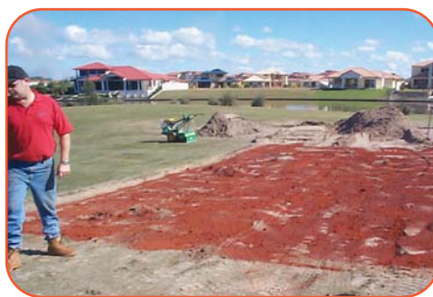
Figure 3: Applying the ViroBind™ reagent to the treatment area.

Three treatment areas were identified, with the first (in the foreground of Figure 3) being an area of substantial acid scalding to which the ViroBind™ reagent was applied as a layer at a depth of about 100mm and mixed lightly by rotary hoe. The second treatment area (in the back-ground of Figure 3) was a similar size area where ViroBind™ reagent was thoroughly mixed with the clay and sand components to a depth of approximately 200mm. The third treatment area (to the left in the background of Figure 3) was a control area that was simply stripped and re-turfed with no addition