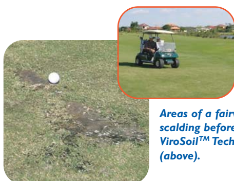
Areas of a fairway affected by acid scalding before (left) and after ViroSoil™ Technology Treatment (above).

“It is clear that the ViroBind™ reagent treatment effectively remedied the scalds and the Riley’s Super Sport Couch fairway grass has fully regrown, with no acid scalds reappearing...”