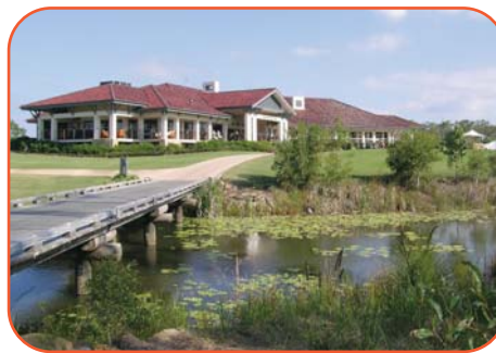
The Club Pelican Golf clubhouse.

As they were in a highly visible part of this world-class golf course, it was deemed vital that the unsightly scalds be effectively treated with something more than a short-term, neutralising "fix". The acid scalds were not only unfavourable from a golfing point of view, but were visibly unattractive, with little or no grass being supported. Lime had been used on a regular basis to treat the scalds since the course was constructed, but it had rapidly washed away or leached from the soil profile during rainfall events. Consequently, the treatments had not provided a permanent or even semi-permanent solution for the scalds or for the treatment of the underlying potential of ASS. Therefore a more sustainable solution was sought, which would not require repeated maintenance and would result in improved fairway appearance.