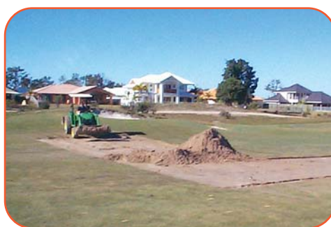
Figure 2: Removing the turf on the affected areas.

To rectify the problem, it was decided that the turf on the fairway would be stripped off (see Figure 2), so that Virotec's patented ViroBind™ reagent could be applied to the affected soil profile at a blending ratio to be determined by Virotec's computerised ASS treatment model, and the turf would be replaced together with some fresh top soil over the project area. The treatment areas would be monitored but largely left to weather for six to eight months and then re-sampled to assess the ASS characteristics of the soil.