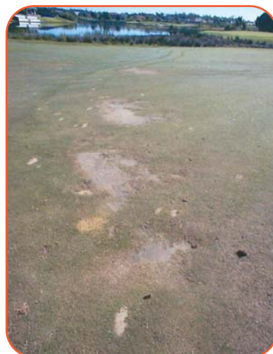
Figure 1: ASS scalds at Club Pelican Golf.

The conversion of potential acid sulfate soils (PASS) to actual acid sulfate soils (AASS) commonly produces pore water and soil leachate pH values of <3.0 . During PASS formation, sulfate in seawater is microbially reduced to sulphide, primarily as hydrogen sulfide, but other organo-sulfides are also produced, and in sediments the hydrogen sulfide can react with ferrous iron ( \text{Fe}^{2+} ) to form iron sulfides (monosulfide black oozes, MBOs) with the end product being iron pyrite ( \text{FeS}_2 ). Later,