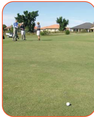
Area treated with ViroSoil™ Technology shows no sign of scalding after 8 months.