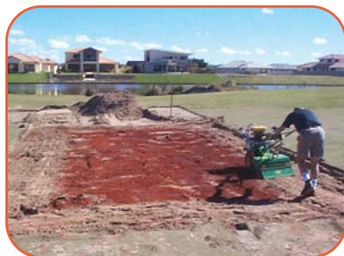
Figure 4 (Left): Mixing the ViroBind™ reagent into the sand and clay of the first treatment area by rotary hoe.