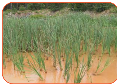
Plant life flourishing near the banks of the treated tailings dam.

The use of ViroMine™ Technology has proven that tailings dam water can be treated in situ to a sufficient quality that it can be discharged to the environment and that exposed tailings can be treated simultaneously to allow sustainable habitat development with minimal on-going costs for managers or regulators.