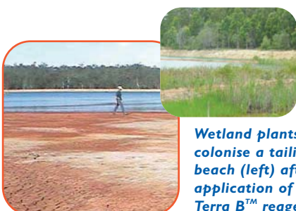
Wetland plants colonise a tailings beach (left) after application of Terra B™ reagent.

“After the treatment and discharge of the tailings dam water, wetland plants have been able to colonise the exposed tailings beach. Before treatment using Acid B™ and Terra B™ reagents no vegetation was able to colonise the exposed tailings or exposed dam walls.”