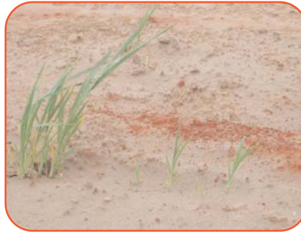
Figure 2. The germination of grass in the acid tailings after mixing the Acid B™ reagent residues, remaining after water treatment, into the exposed tailings beach.