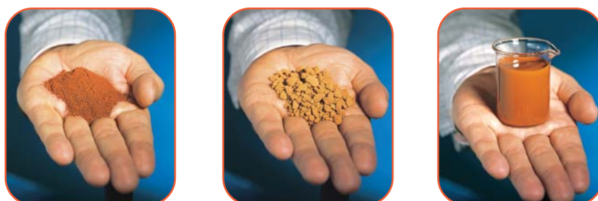
Virotec's reagents can be applied in powder, pellet or slurry form.

In a world first, Virotec undertook a trial to revegetate acidic tailings. The trial mixed the layer of the Acid B™ reagent residue remaining after treating the water in the tailings dam with the tailings to allow the growth of pasture grass.