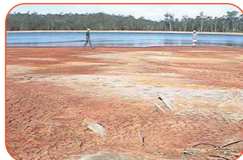
Figure 1. This photo shows the exposed area of tailings where grass was grown during this study. The photo also shows the very thin layer of the Acid B™ reagent that remained after the water had been released from the tailings dam.

Virotec used ViroMine™ Technology to treat the water in situ in a world first demonstration of its new technology. After the water was treated to the stringent environmental discharge standards, 350 ML of water was released from the tailings dam into the local catchment. The decrease in the water volume left exposed areas of tailings (Figure 1), and in 2002 Virotec undertook trials using the Terra B™ reagent to revegetate the tailings.