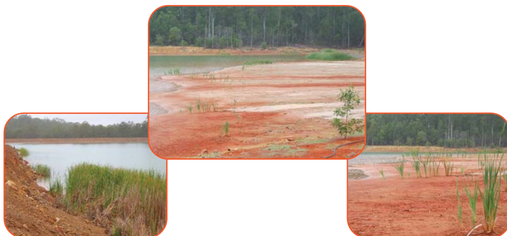
Figure 3. After the treatment and discharge of the tailings dam water, wetland plants have been able to colonise the exposed tailings beach. Before treatment using Acid B™ and Terra B™ reagents no vegetation was able to colonise the exposed tailings or exposed dam walls.

The results showed that the spent Acid B™ reagent had enough residual alkalinity to allow the growth of grass by neutralising acidity in the exposed tailings (Plate 2). The improvement in water quality also allowed the successional establishment of pioneer riparian wetland vegetation (Plate 3).