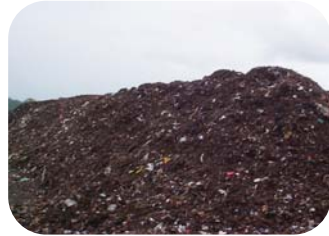
Composting piles at Tryton's processing facility in Lismore, NSW, Australia.