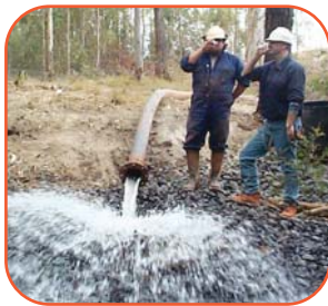
First release of treated water using ViroMine™ Technology from tailings dam.

In 1999, Virotec undertook the treatment of the 1.6 billion litre tailings dam, using ViroMine™ Technology Acid B™ reagent, which was sprayed on to the surface of the dam. Following treatment, the dam water met stringent ANZECC standards for heavy metals and the protection of aquatic ecosystems. Approximately 350 million litres of water were subsequently released with safety into the local catchment.