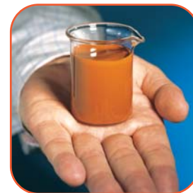
ViroMine™ Technology reagents are applied in powder, pellet or slurry form.