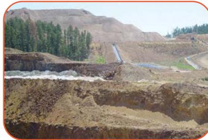
The vast quantity of heap leach ore remaining on the heap leach pad.