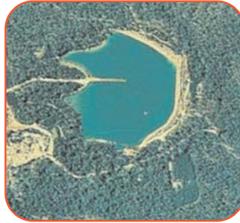
The contaminated tailings dam contained 1.6 billion litres.