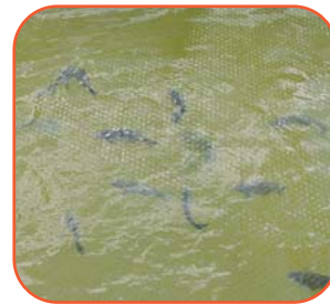
Fish in treated dam.