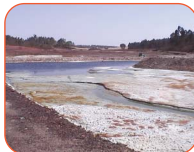
In this 25 ML tailings dam the total dissolved metal load equated to approximately 170 tonnes of dissolved metal.

The most serious issue relates to the potential of tailings dams to fail or collapse, claiming lives and causing considerable environmental damage. The damage caused by these failures in terms of human casualties, destruction of property, disruption of communications, pollution of the environment and economic loss to the mining industry is enormous.