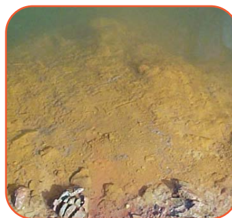
Contaminated water in the tailings dam before treatment with ViroMine™ Technology.

In 1996, a major inflow of water almost filled the 35 acre dam. The situation deteriorated over time, and grave concerns regarding uncontrolled discharge across the spillway or breach of the dam wall were expressed by environment authorities.