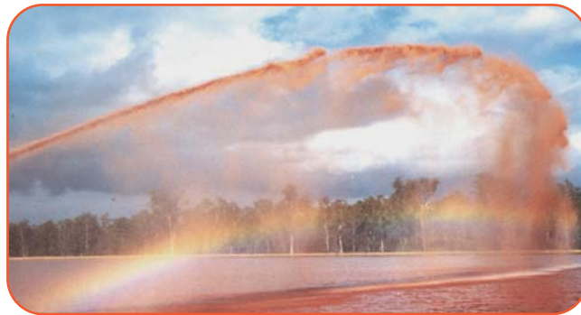
ViroMine™ Technology reagents are applied to tailings dams in a single stage, in-situ treatment.