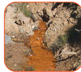
Some examples of ARD. Mines can generate ARD for thousands of years.

Typical sources of Acid Rock Drainage at mine sites are underground workings where ground water percolates through a honeycomb of tunnels and shafts, piles of waste rock, mining overburden and exposed tailings. Mines may be a source of Acid Rock Drainage for thousands of years.