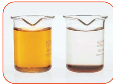
Acid Rock Drainage before and after ViroMine™ Technology treatment.

Most trace metals are initially trapped by adsorption. ViroMine™ Technology reagents are dominated by particles with a high surface area-to-volume ratio and high change-to-mass ratio. During aging, elements are redistributed to become structural components of new minerals during recrystallisation.