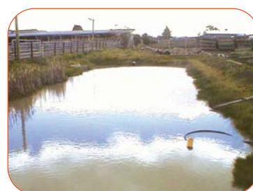
Left: A leachate pond before treatment.