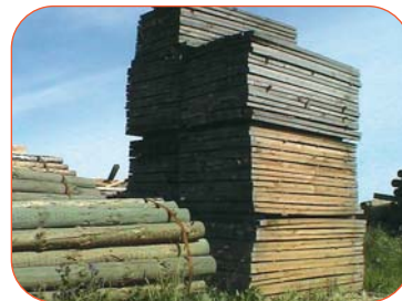
Left: Timber being treated with copper chrome arsenate. Right: Leachate from stored timber is contaminated with heavy metals.

Copper (Cu) and arsenic (As) are used as fungicides and insecticides, while chromium (Cr) fixes these chemicals into the wood. As Beder (2003) explains, “the (CCA) chemical mixture is injected into the wood under pressure so that the wood is saturated with the chemicals. It prevents rotting, fungi, termites and marine organisms”.