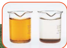
Water contaminated by AMD – before and after ViroMine™ Technology treatment