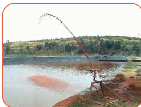
Figure 7. Application of Acid B Extra™.

As shown in Figure 7, the water was treated over five days using an in-situ aerial application technique. This application method can be used on small dams, but also has been used successfully on large dams such as the 14 ha surface area dam at Mt Carrington in Australia. The engineering and plant requirement to implement this treatment technique is very simple and can be constructed from machinery available at most mine sites.