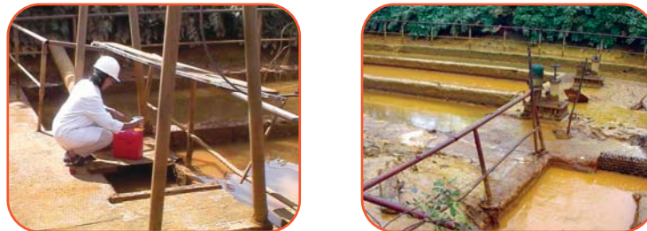
Figure 4 & 5. These concrete channels were the input to the lime treatment plant in Baia Mare. Two mega litres of AMD water was transferred from this plant to a containment dam that was used to test the Acid B Extra™ reagent.

release of metals and acidity from soil, waste rock and tailings.