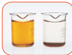
Water contaminated by AMD before and after ViroMine™ Technology treatment.

Furthermore, no unstable sludge was produced and sediment from the application of ViroMine™ Technology can be reused as an effective soil conditioner to assist revegetation programs.