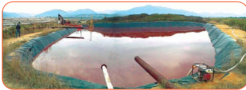
Figure 6. This pond was constructed to conduct the Acid B™ Extra reagent AMD treatments in Baia Mare. The pond was lined with geosynthetic liners and contained 2 ML of water.