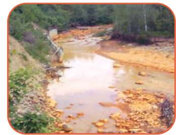
Figures 1-3. Photos of local rivers and streams polluted with uncontrolled AMD plumes from historic and operational mines in the Baia Mare region.